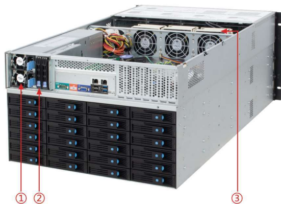
①. CRPS Power Supply ③. Hot-swap Fan Module ②. 2*2.5" HDD/SSD