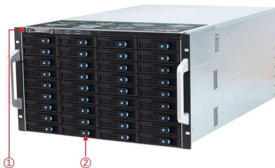
①. Switch Components ②. HDD Tray